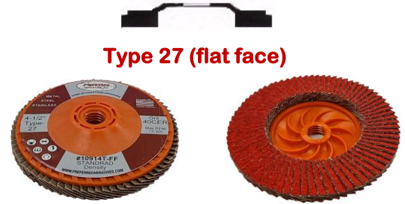
Type 27 (flat face)

Fiberglass backing plates are also available in both Type 27 and Type 29.