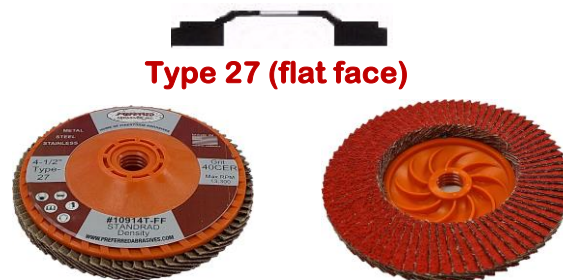
Type 27 (flat face)

Fiberglass backing plates are also available in both Type 27 and Type 29.