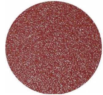
AO HEAVY DUTY

AO HD: Premium AO grain used for general purpose applications. Discs have an extra durable, heavy duty red "LANTUCK" backing, which helps prevent snagging.