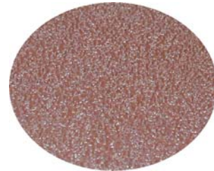
AO COMPACT GRAIN

Competitive Products: 3-M: 359F Multicut VSM: KK718X Compact Grain