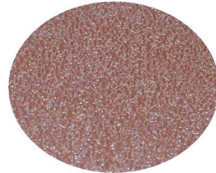
AO COMPACT GRAIN