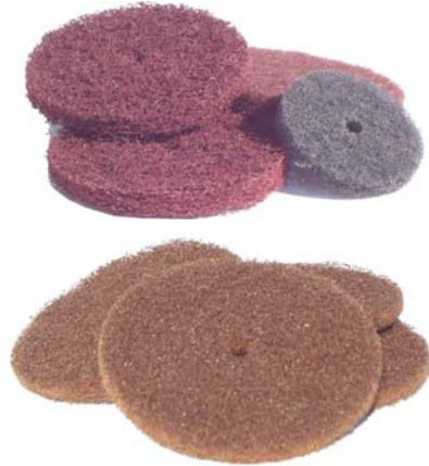
TAN X-CRS = 3M Cut & Polish®